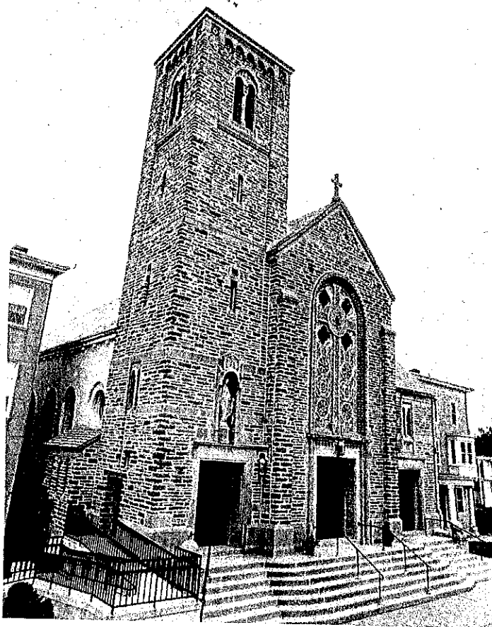
Immaculate Conception Church Exterior with Ramp installed in 1990.